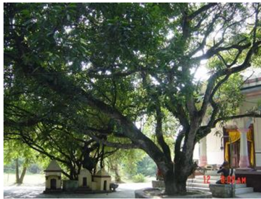
Gokul village where Krishna grew up.

As Krishna grew up in Gokul, he enjoyed playing Ras leela [Play of Sweet taste or aesthetic flavour] in Braj Brindaban with Radha, and Gopis of Brindaban. Then, when he reached the age of 11, he was separated from Radha for one hundred years because of the curse by ShreeDam.