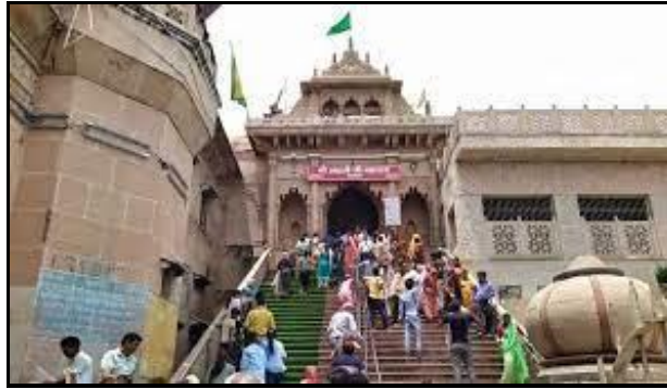
Radha Temple in Barsana [Radha's birthplace]

Aware of the extreme emotional distress and physical torment of Radha, the compassionate Krishna gently gathered Radha up on his lap and kissed her repeatedly. With a charming smile that exuded tender love, Krishna began to ease Radha's anguish.