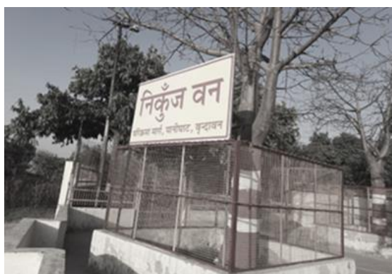
Nikunjban, Panighat, Brindaban. On the banks of Jamuna (Yamuna) River [ cf. Mohe panghat me Nand lal chera gayo re ... (Mughal-e-Azam) ]

Narayan replied, "It is all about the Amrit-like Hari Leela, listening to which will wash away your sins. On a fun filled day, immortal Hari played Ras leela with Radha. Having danced at the circular dancing ground of Hari, they went to Nikunj ban for a passionate pastime.