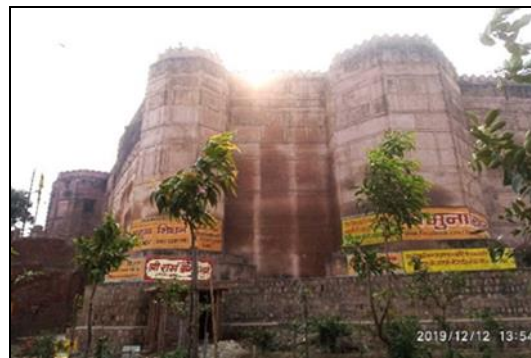
Birthplace of Krishna.

Whilst, in Mathura, in the fort prison of King Kansa, furtively and immediately after birth, the baby boy [Krishna] was smuggled out to Gokul village, across the Jamuna River, by his father Vasudev.