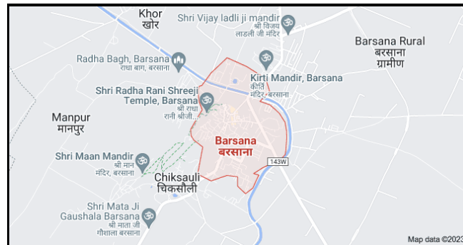
Radha's birthplace Barsana

Meanwhile, at the same hour, day, month, and the year, Yashoda at the village of Gokul, gave birth to a baby girl, Yoganidra, or Yogamaya. As Yashoda fell asleep due to exhaustion of childbirth, she did not know the gender of her baby.