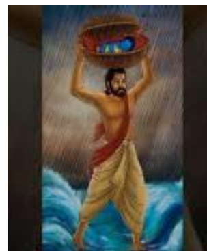
Imagery of Basudev carrying baby Krishna across Jamuna River in rain with thunder

It was possible only because all the Kansa's guards in the prison and the palace were put to sleep under a spell with rain with thunder. When Basudev reached Gokul, he picked up the