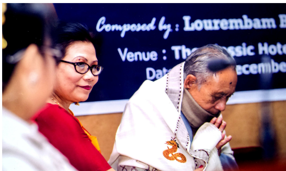
Design by: Nongamba Sorokhaibam